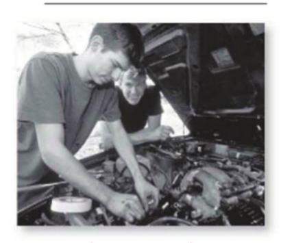
7. they're going to fix the