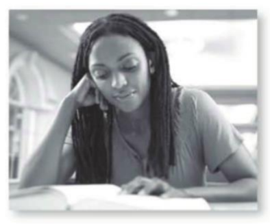
She's going to study