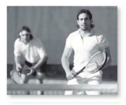
4. They're going to play tennis