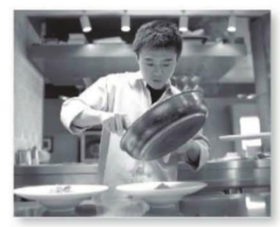
2. They're going to cook denner 3.