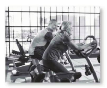
1. They're going to go to the gym.

A What are these people going to do next weekend? Write sentences.