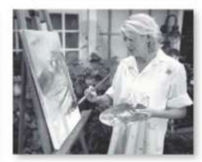
6. She are going to draw