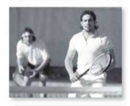
4. They are going to play tennis