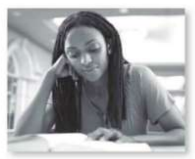
She is going to read