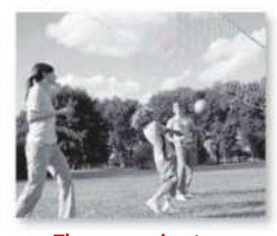
8. They are going to play voleyball