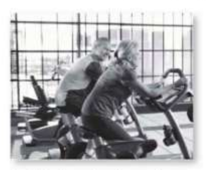
They're going to go to the aym.

A What are these people going to do next weekend? Write sentences.