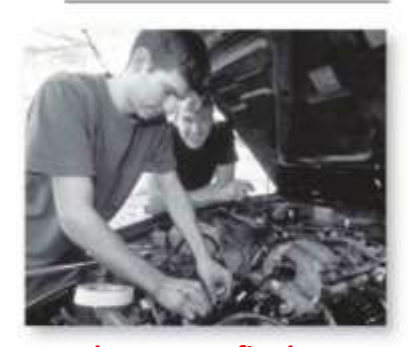
7. They are to fix the car