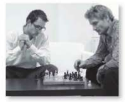
9. They are going to play chess