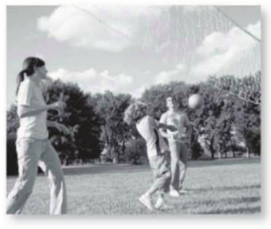
They're going to 8. play voleyball