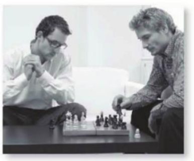
9. They're going to play chess

B What are you going to do next weekend? How about your family and friends? Write sentences. I'm going to dinner with my family 1. _