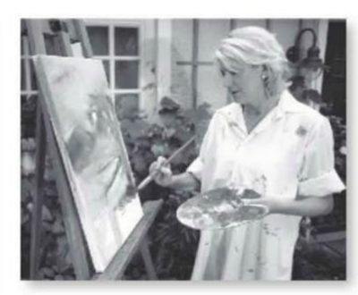
6. She's going to draw