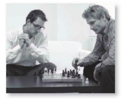
9. They're going to play chess