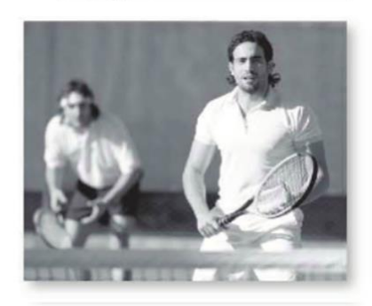
4. They're going to play tennis