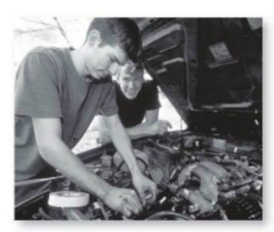
7 They're to fix the car