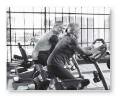
They're going to go to the gym.

A What are these people going to do next weekend? Write sentences.