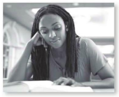
She's going to read