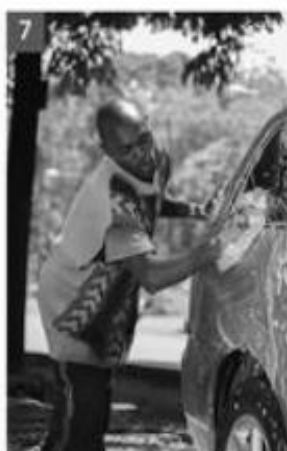
wash the car