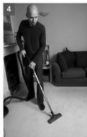
clean the house