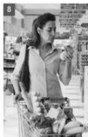
go grocery shopping