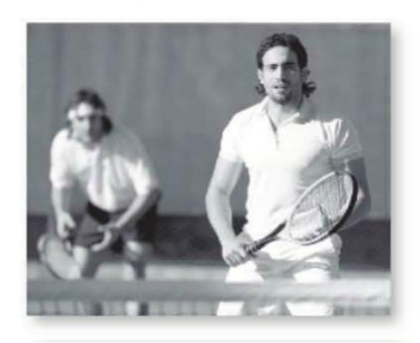
4. They're going to play tennis