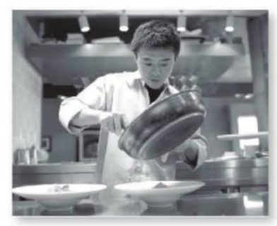
2. He's going to cook