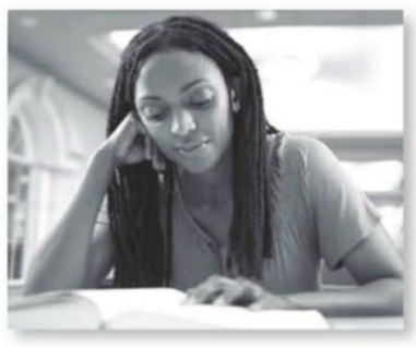
She's going to read