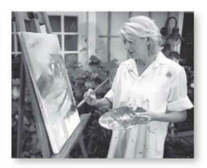
6. She's going to draw