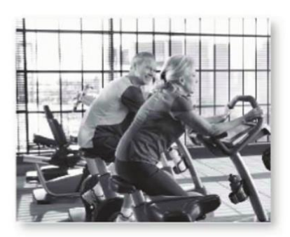
They're going to go to the gym.

A What are these people going to do next weekend? Write sentences.