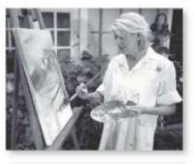
6. She's going to paint