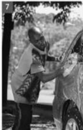
wash the car