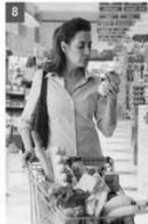
go grocery shopping