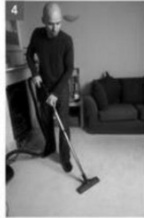
clean the house