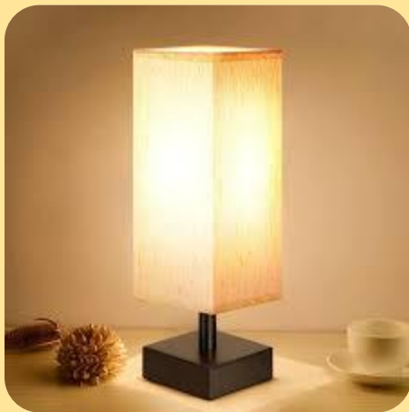
UNIVERSIDAD DEL SURESTE lamps