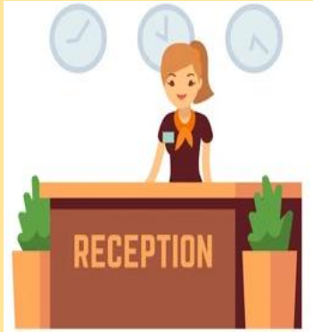
Front desk clerk