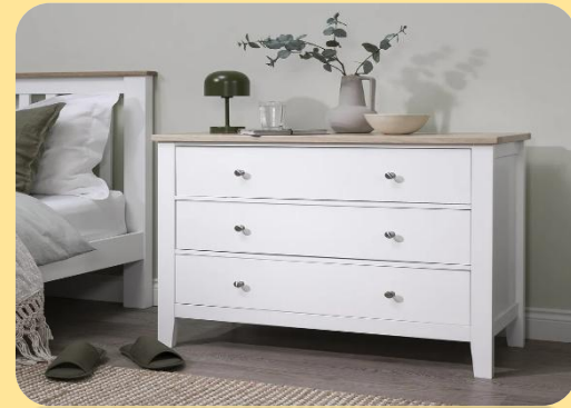
Chest of drawers