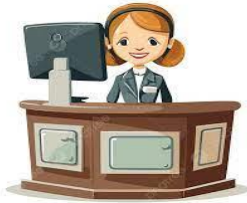
Front Desk Clears