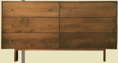
Chest of drawers