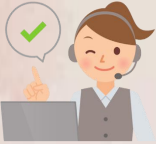
FRONT DESK CLERK