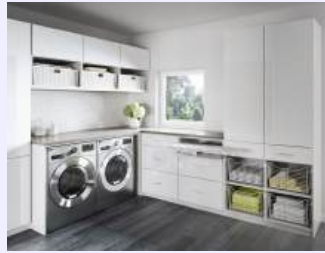
LAUNDRY ROOM / CUARTO DE LAVADO