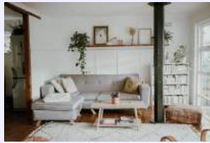
LIVING ROOM / SALA DE ESTAR