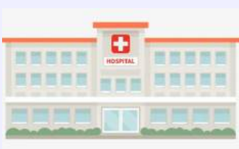
DOCTOR NURSE SECURITY GUARD