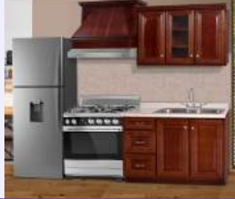
KITCHEN / COCINA