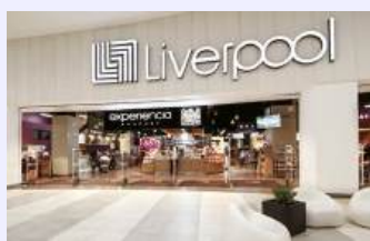
SALESPERSON CAISHER OFFICE MANAGER