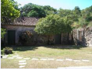
YARD / JARDIN