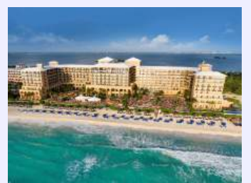
BELLHOP TAXI DRIVER CAISHER RECEPTIONS