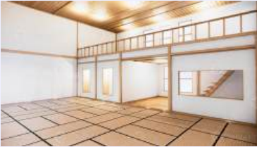
FIRST FLOOR / PRIMER PISO