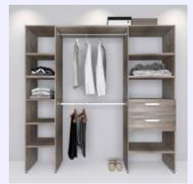
CLOSET / GUARDA TOPA