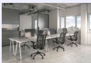
OFFICE MANAGER ACCOUNTANT FRONT DESK CLERK