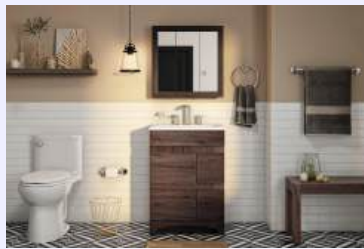
BATHROOM / BAÑO