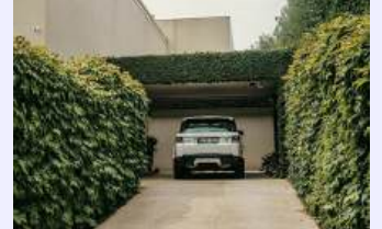
GARAJE / COCHERA