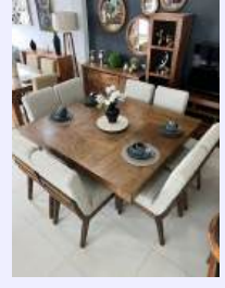
DINING ROOM / SALA DE ESTAR