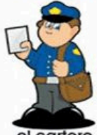
el cartero postal worker