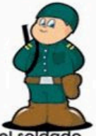
el soldado soldier