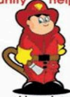
el bombero fire fighter