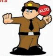
el agente de tránsito transit agent