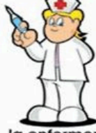
la enfermera nurse