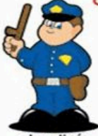
el policia police officer