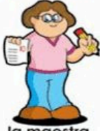
la maestra teacher