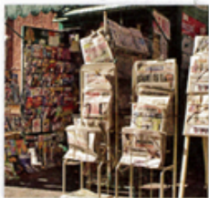
5. a newsstand