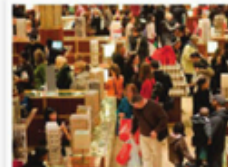
10. a department store