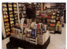
6. a bookstore