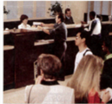
3. a bank