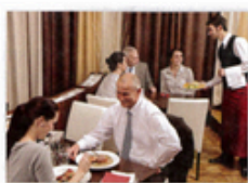
2. a restaurant