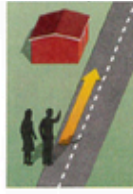
2. down the street