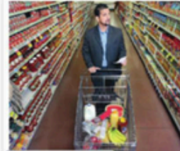
8. a supermarket