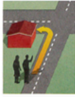
3. around the corner