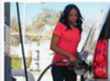
9. a gas station