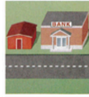
6. next to the bank