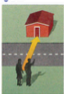
1. across the street