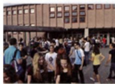
4. a school