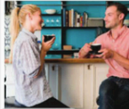
7. a coffee shop