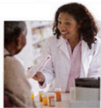
1. a pharmacy