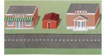
7. between the bookstore and the bank