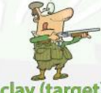
clay (target) shooting