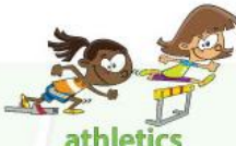
athletics (track and field)