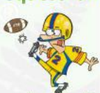
football American football