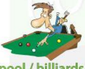
pool / billiards