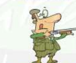
clay (target) shooting