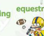
football American football