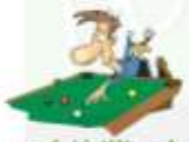
pool / billiards