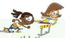
athletics (track and field)