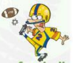
football American football