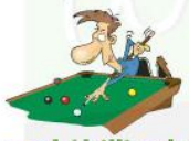
pool / billiards