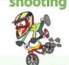
downhill mountain biking