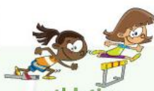
athletics (track and field)