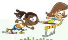
athletics (track and field)