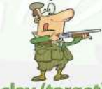
clay (target) shooting