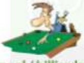
pool / billiards