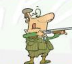
clay (target) shooting