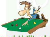
pool / billiards