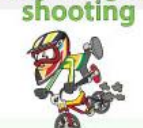
downhill mountain biking