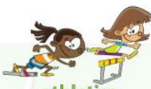
athletics (track and field)