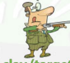
clay (target) shooting