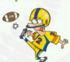
football American football