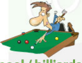
pool / billiards