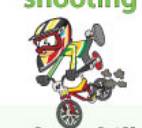
downhill mountain biking