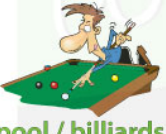
pool / billiards