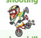
downhill mountain biking