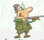
clay (target) shooting