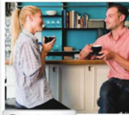
7. a coffee shop