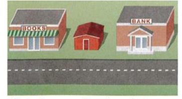
7. between the bookstore and the bank