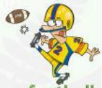
football American football