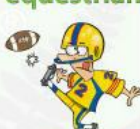
football American football