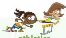
athletics (track and field)