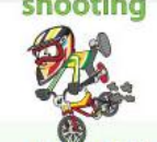
downhill mountain biking