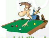
pool / billiards