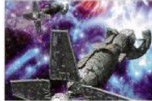
a science-fiction film