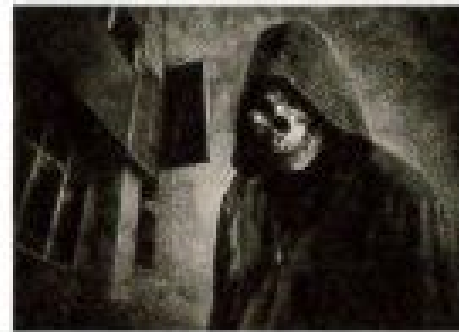
a horror film