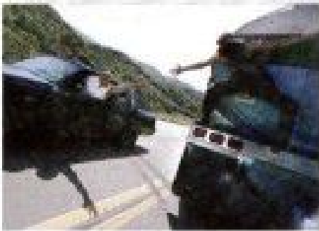
an action film