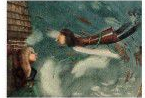
an animated film