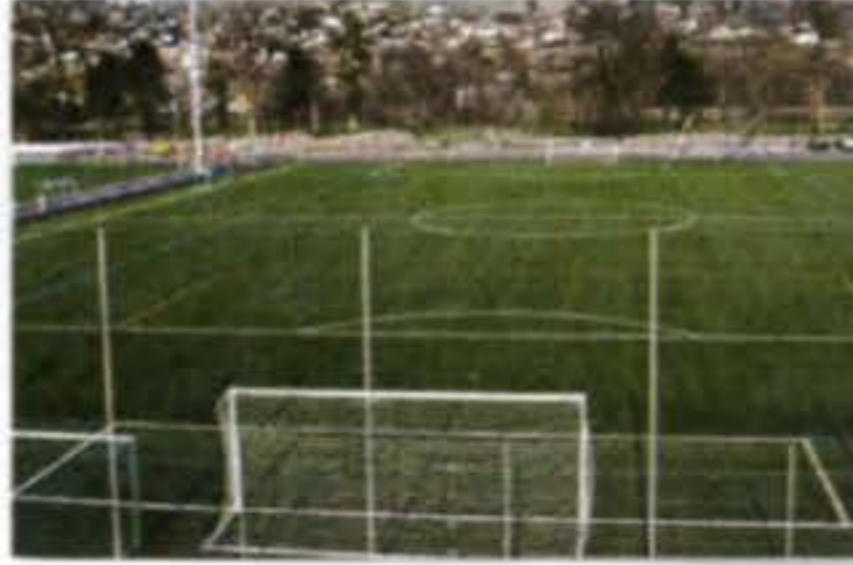
an athletic field