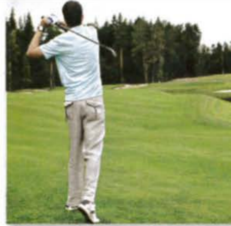
a golf course