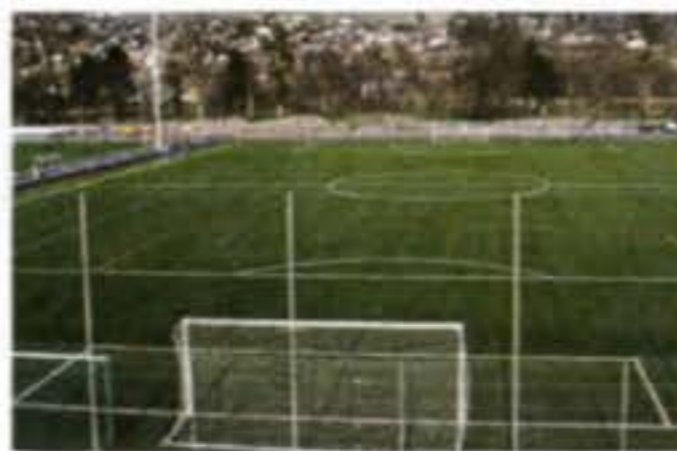
an athletic field