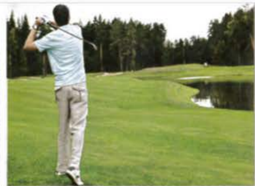
a golf course