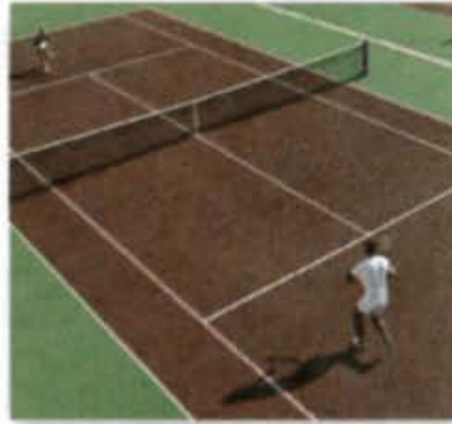
a tennis court