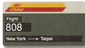
a non-stop flight