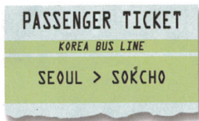
a one-way ticket