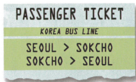
a round-trip ticket