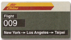
a direct flight