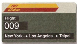
a direct flight