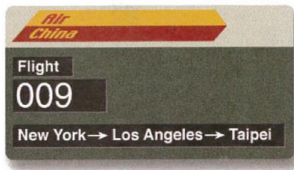
a direct flight