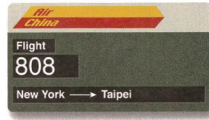
a non-stop flight