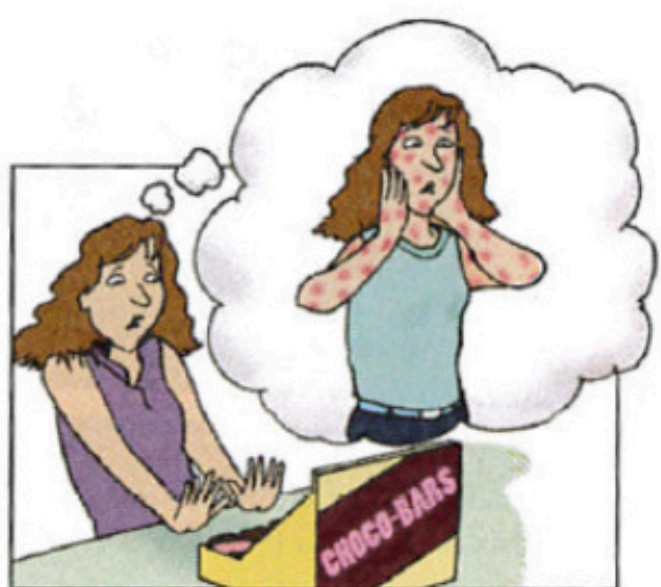
I'm allergic to chocolate.