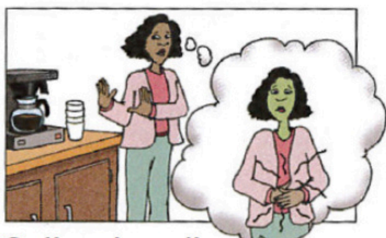
Coffee doesn't agree with me.