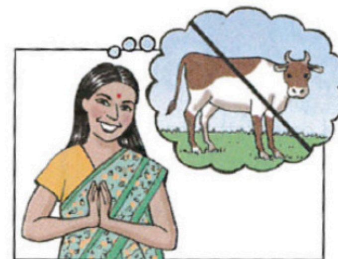
I don't eat beef. It's against my religion .