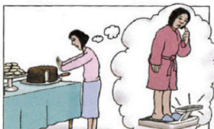
I'm avoiding sugar.