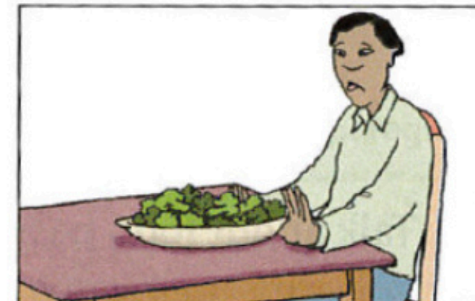
I don't care for broccoli.

Exercise 5. Escribe 7 oraciones usando las palabras en negritas.