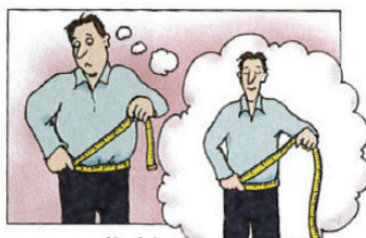
I'm on a diet / I'm trying to lose weight .