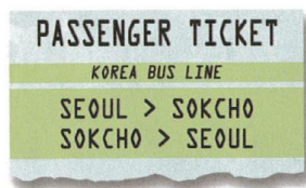
a round-trip ticket