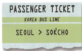
a one-way ticket