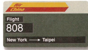
a non-stop flight