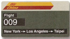
a direct flight