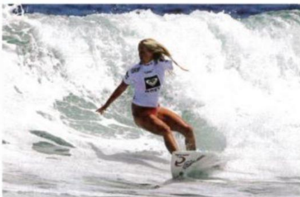
Hamilton was attacked by a tiger shark when she was thirteen.