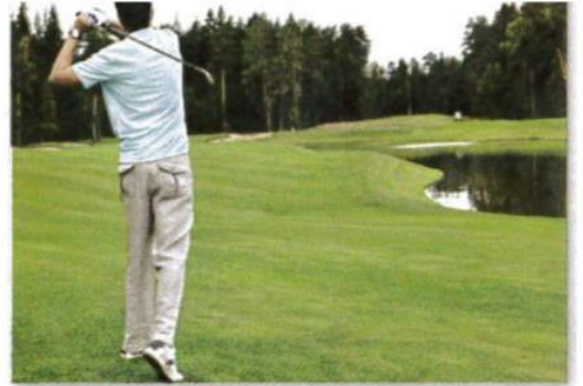
a golf course