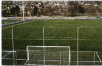
an athletic field