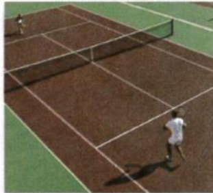
a tennis court