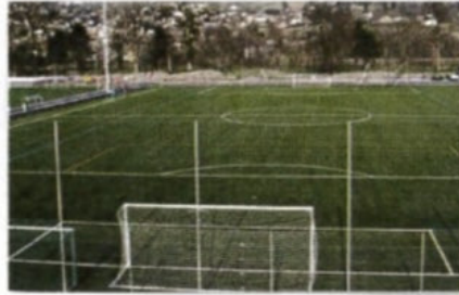
an athletic field