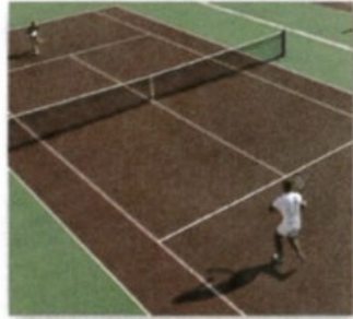
a tennis court