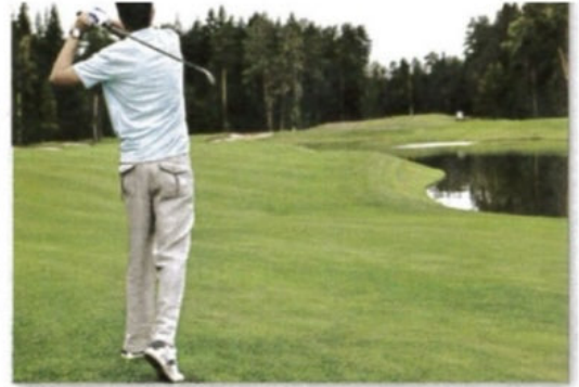
a golf course