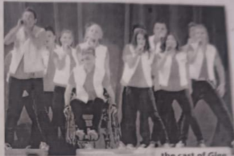
the cast of Glee