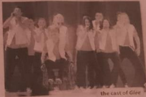
the cast of Glee