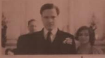
3. Colin Firth is an actor