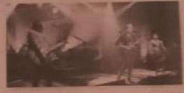
2. The Kings of Leon are a rock band