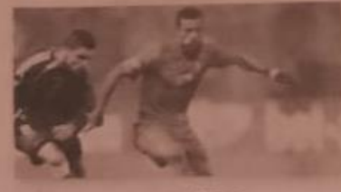
4. Nani is a soccer player