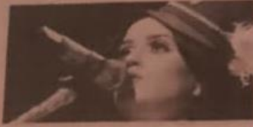
1. Katy Perry is a singer