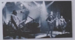
2. The Kings of Leon are a rock band.