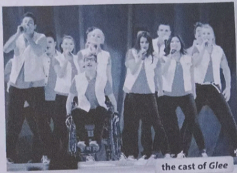
the cast of Glee