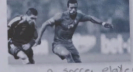
4. Nani is a soccer player.