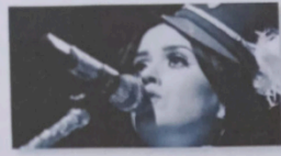
1. Katy Perry is a singer.