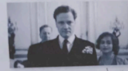
3. Colin Firth is an actor.