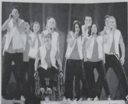
the cast of Glee

B: that sound great • That sounds great! • I don't agree.