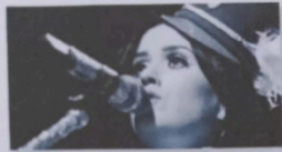
1. Katy Perry is a singer.