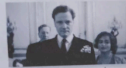
3. Colin Firth is an actor.