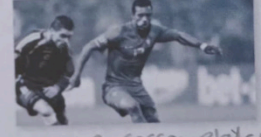
4. Nani is a soccer player.