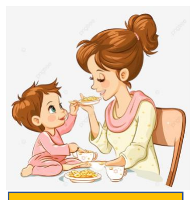
She has lunch at 2:00 pm