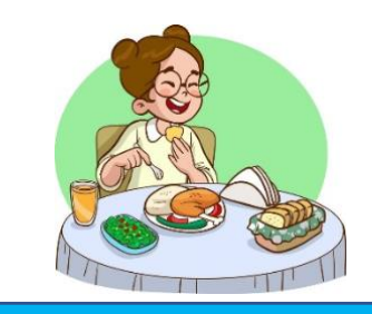
I have breakfast at 8:00 am