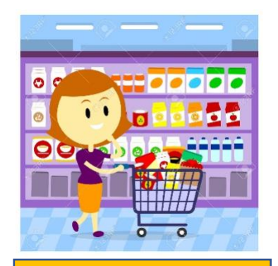
She goes grocery shopping