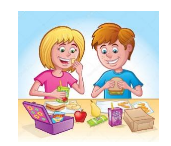
I have lunch at 2:00 pm