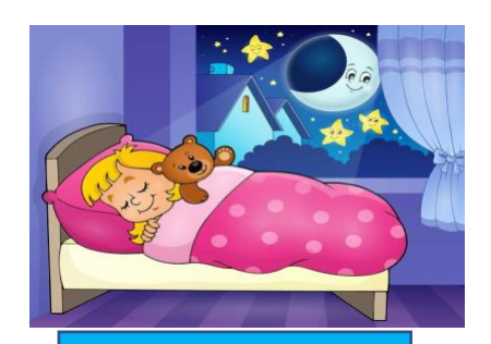
I go to bed at 10:30 pm