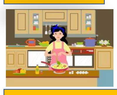
She cooks dinner at 8:00 pm