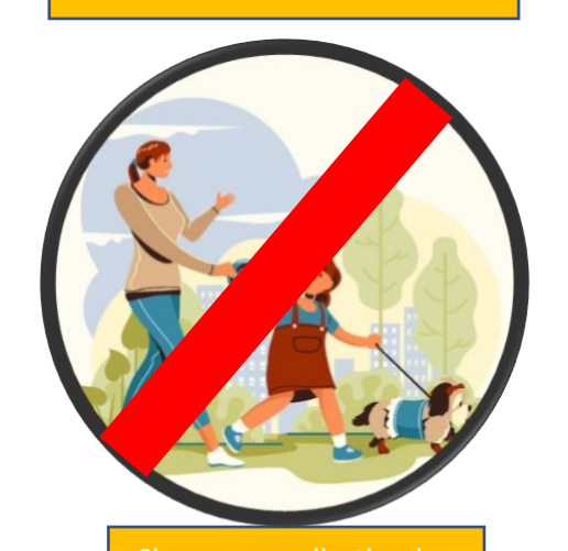
She never walks the dog