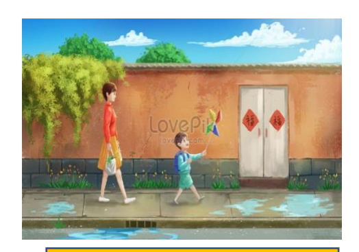
She gets home at 1:00 pm