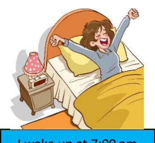
I wake up at 7:00 am