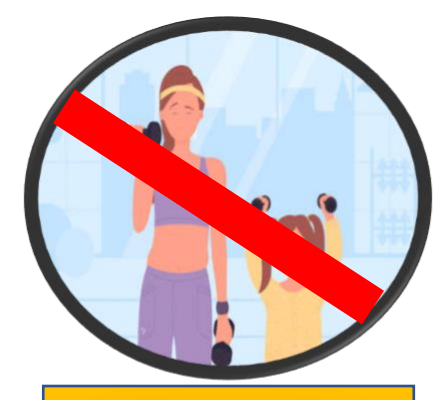
She never goes to the gym