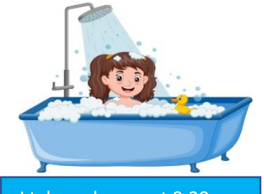
I take a shower at 9:30 pm