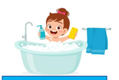
I take a shower at 7:30 am