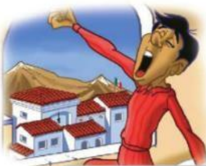
Mexico City 6:00 A.M.