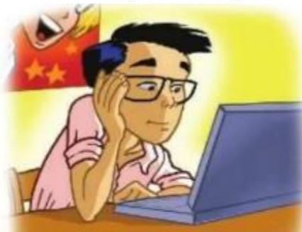
Tokyo 9:00 P.M.