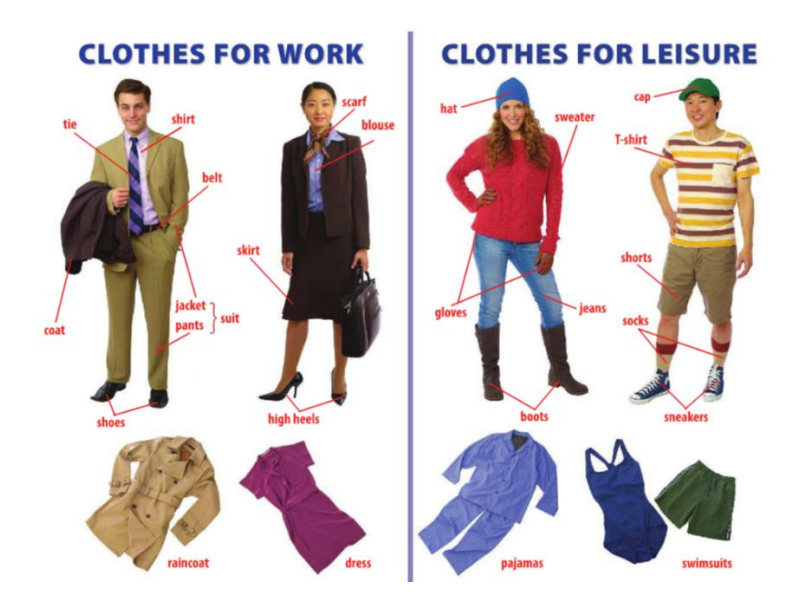
Exercise 1. Translate to spanish the vocabulary above – Traduce al español el vocabulario de arriba.