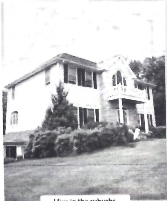
I live in the suburbs.

B Correct the false statements in part A.