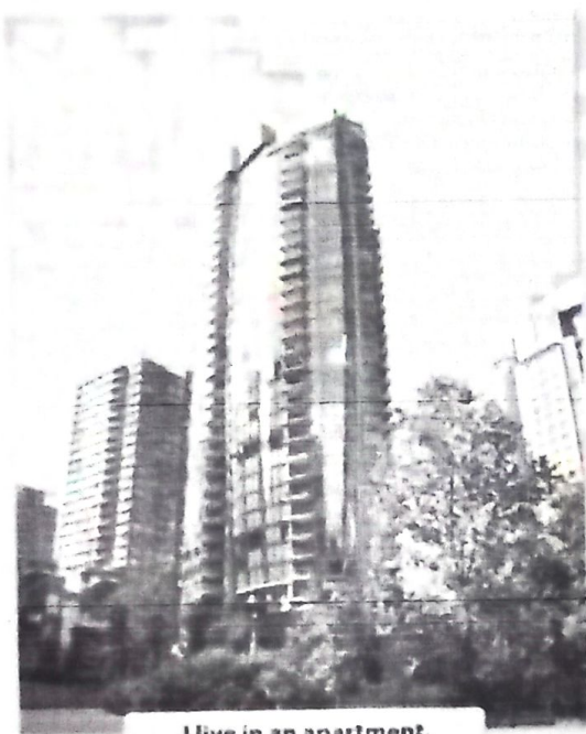
I live in an apartment.