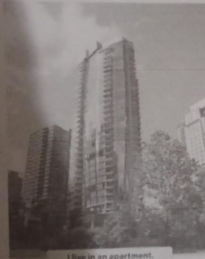
I live in an apartment.