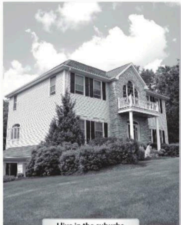
I live in the suburbs.

B Correct the false statements in part A.