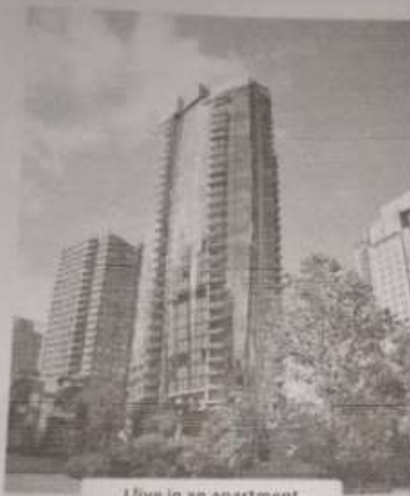
I live in an apartment.