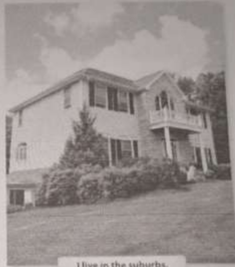
I live in the suburbs.

B Correct the false statements in part A.