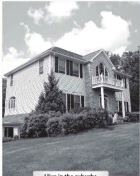
I live in the suburbs.

B Correct the false statements in part A.