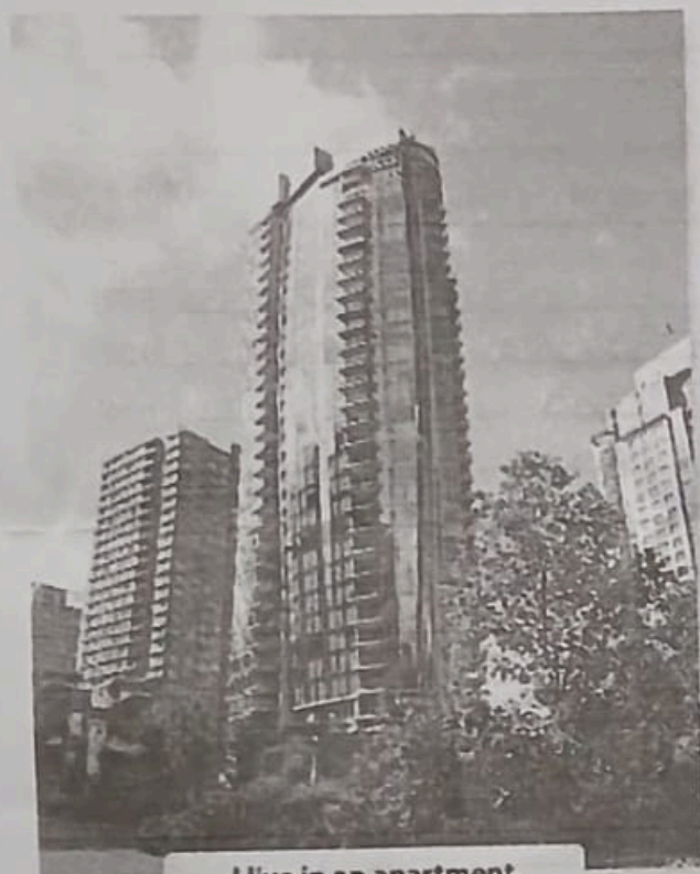
I live in an apartment.